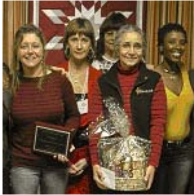
SEED Winnipeg, 2008

The inaugural Worker Co-op 'Best Practices Award' will be given out at this year's 2010 CWCF Annual Conference in Vancouver (October 28-30). The Best Practices Award will enable sharing of innovative practices with other worker co-operatives in Canada to help strengthen the movement. It will also recognize worker co-operative excellence. There is a lot of great work being done, so let's celebrate it.